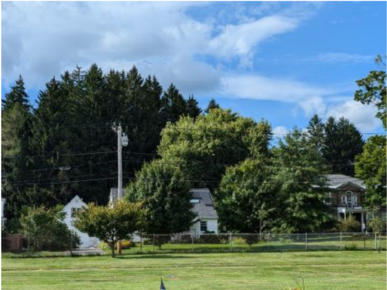
Mature Norway spruce at the project site tower over homes on North Street

The proposed development at 8 View Ave in Northampton's Ward 3B poses a significant threat to the area's limited and declining tree canopy. This report highlights the role this woodland plays in mitigating heat, providing a crucial environmental buffer for the neighborhood. This woodland should be preserved to mitigate heat, maintain environmental balance, and protect the quality of life for residents. We urge the rejection of this project to safeguard this irreplaceable ecological resource.